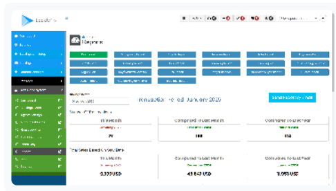
Unique Co-op Reporting